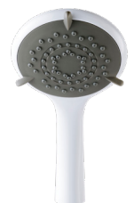
Inclusive Showerhead (5 Spray Pattern) TSHECAREWHT