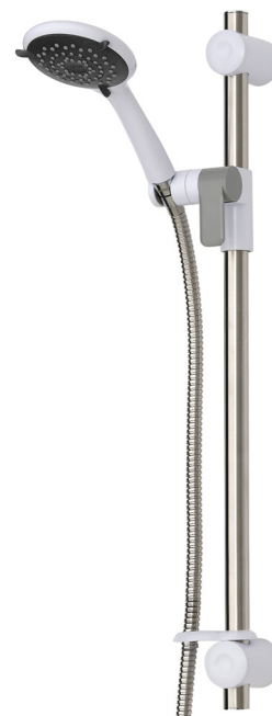
Omnicare Kit (680mm) White GAUF1