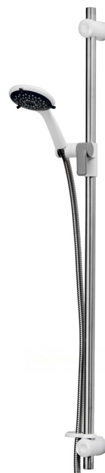
Omnicare Extended Kit (940mm) White GAOMDF1