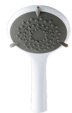
Inclusive Showerhead (5 Spray Pattern) TSHECAREWHT