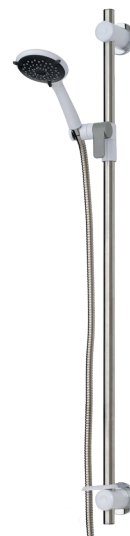
Omnicare Grab Kit (1100mm) White GAUPGF1