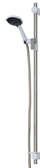
Omnicare Extended Kit (1080mm) White GAUPF1