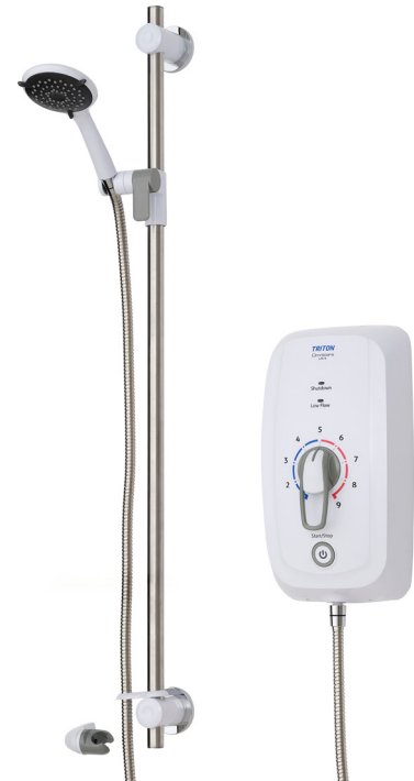
Omnicare Ultra+ Align with Grab Kit