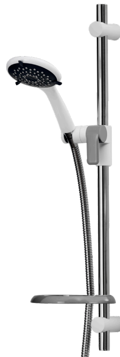
Omnicare Kit GAUF1

Replacing specified Triton accessories for this Omnicare unit will aid optimum performance and keep the unit within the allocated guarantee period