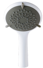
Inclusive Showerhead (5 Spray Pattern) TSHECAREWHT