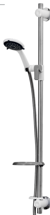
Omnicare Design Grab Kit GAOMDGF1

Replacing specified Triton accessories for this Omnicare unit will aid optimum performance and keep the unit within the allocated guarantee period