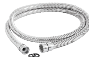
2m Anti-twist Hose - Chrome TSHG1266