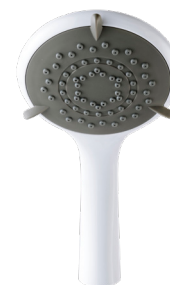
Inclusive Showerhead (5 Spray Pattern) TSHECAREWHT