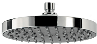
Isabel Circular Fixed Shower Head - Chrome TSHFISABCH