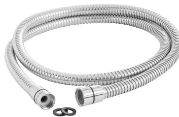
1.25m Anti-twist Hose - Chrome TSHG1203