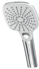
Verity 3 Spray Push Button Shower Head GAHSVE32