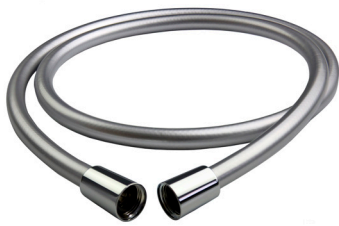
1.5m Smooth Hose - Chrome TSHM150S